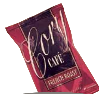
Cory® Café Gourmet Coffee

Savor the flavors found in upscale coffee bars, including Hazelnut Crème and Vanilla Fantasia. Blended from 100% arabica beans.