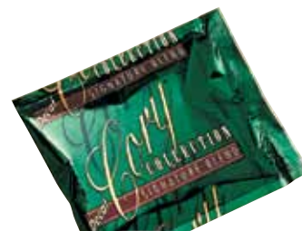
The Cory® Collection

All Cory blend coffees contain more than 75% mountain-grown arabica coffee. Our 100% Colombian, Signature Blend and Sequoia Dark are 100% arabica coffee.