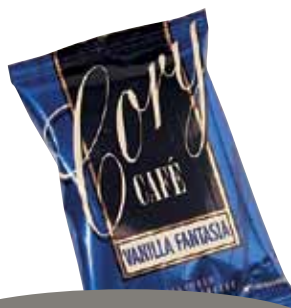
Cory® Café Flavored Coffee

All Cory blend coffees contain more than 75% mountain-grown arabica coffee. Our 100% Colombian, Signature Blend and Sequoia Dark are 100% arabica coffee.