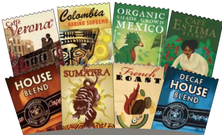
Starbucks® Interactive Cup® Brewer

Increased employee morale and productivity— with every single cup.